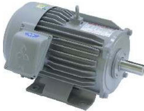
SF-JR 3HP 4P 100L

Totally Enclosed Fan Cooled Type, IP 55 Degrees of Protection